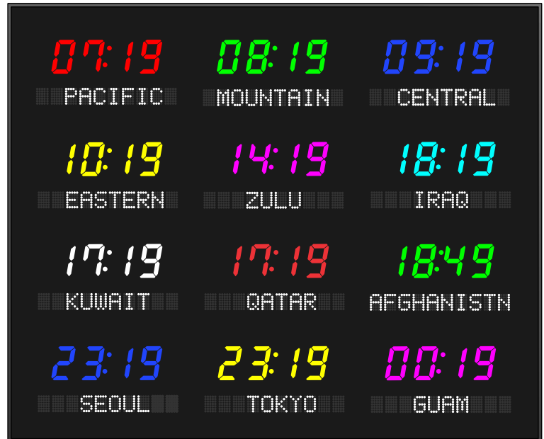
Model 6612Y - 2.5" time, 1.2" zone labels, 12 zones